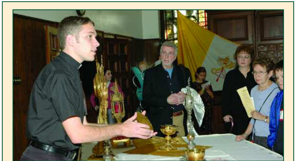
SEMINARIANS EXPLAINED THE MEANING AND PURPOSE OF VARIOUS LITURGICAL ITEMS TO VISITORS AT THE SEMINARY'S ANNUAL OPEN HOUSE, WHICH WAS ATTENDED BY OVER 500 GUESTS ON SUNDAY, OCTOBER 31, 2004. THE SEMINARY LOOKS FORWARD TO WELCOMING THE SURROUNDING COMMUNITY AT THIS TIME EACH YEAR.