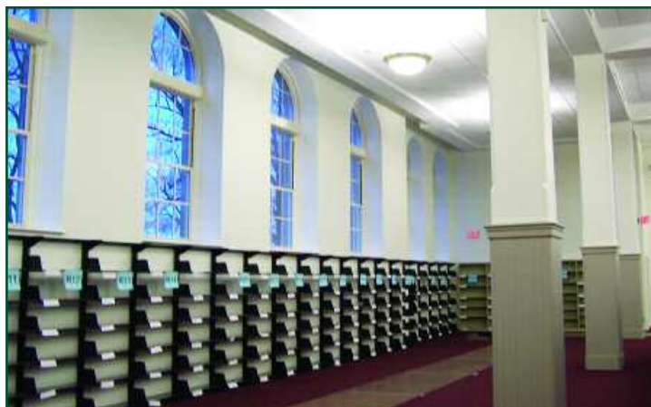
A VIEW OF THE WESTERN WALL ON THE LIBRARY'S LOWER LEVEL DEMONSTRATES THE INCREASE IN SHELVING SPACE, WHICH WILL ENABLE THE SEMINARY TO ACCOMMODATE THE LIBRARY'S GROWING COLLECTION.

The Ryan Memorial Library Renovation Project, scheduled for completion in the fall of 2005, is yet another sign that the St. Charles Seminary community is living and growing to meet the needs of the Church in the Third Millennium, while holding fast to that which it has inherited from its cherished past. As a transitional deacon approaching Ordination to the Priesthood, it is most gratifying to witness firsthand the commitment of the Seminary to serve the intellectual needs of this and future generations.