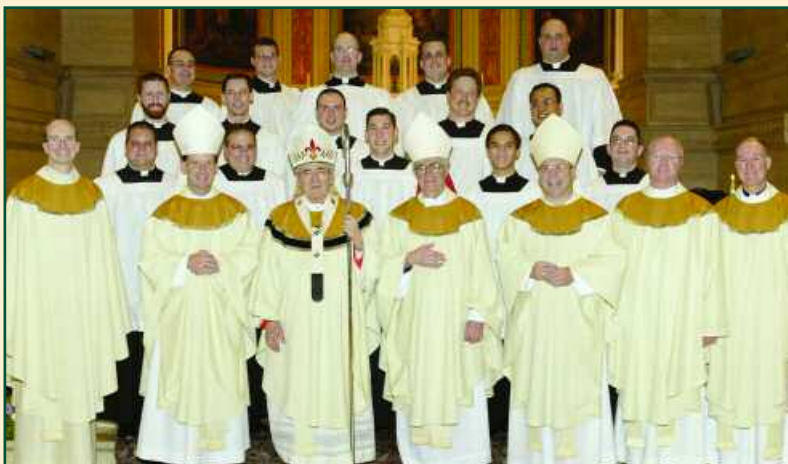
FIFTEEN MEN IN THE SEMINARY'S SECOND THEOLOGY CLASS WERE INSTITUTED INTO THE MINISTRY OF READER BY HIS EMINENCE, CARDINAL JUSTIN RIGALI ON NOVEMBER 4, 2004, THE PATRONAL FEAST OF SAINT CHARLES BORROMEIO. DURING THE MASS, HIS EMINENCE REMINDED THESE MEN THAT THEY ARE TO TURN ALWAYS TO SAINT CHARLES, THEIR PATRON AND GUIDE, AS THEY CARRY OUT THEIR NEW DUTIES AND CONTINUE FORMATION FOR SERVICE IN THE SACRED PRIESTHOOD.

Other Alumni Classes and Jubilarians are welcome to make honorarium contributions to this project as well as other initiatives at the Seminary. Please contact the Office for Institutional Advancement at 610-785-6231 for more information.