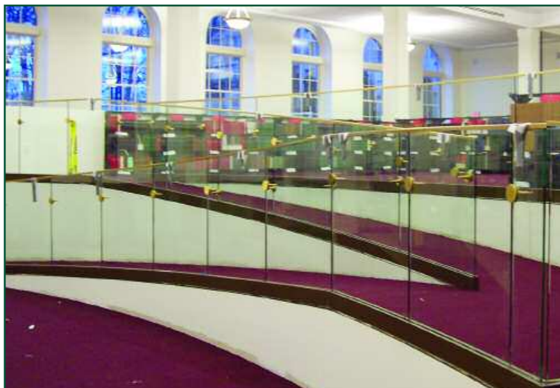
THE PICTURED GLASS ENCASED RAMP, ALONG WITH THE INSTALLATION OF ELEVATORS, WILL ALLOW EASY ACCESS FOR VISITORS.

Anything that lives and grows must adapt to meet new needs while retaining its own identity. The Ryan Memorial Library at St. Charles Borromeo Seminary is a case in point. There was much joy in our Seminary community last spring when it was announced that the Library would be completely renovated to address a variety of problems threatening the building and its collections. All of the careful planning and consideration that went into this project began to come to fruition when construction on its first phase began last April. This phase, which made improvements to the Lower Level of the Library, was completed on schedule in mid-December 2004, and the newly renovated Library is now beginning to take shape.