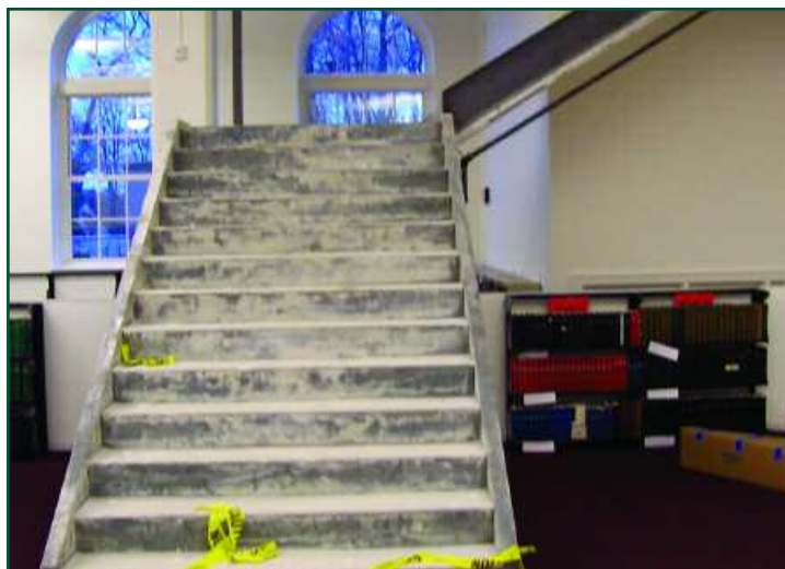
THE INSTALLATION OF THE GRAND STAIRCASE, WHICH WILL BE FINISHED LATER IN THE PROJECT, SERVES TO CONNECT THE LOWER AND UPPER LEVELS OF THE LIBRARY.