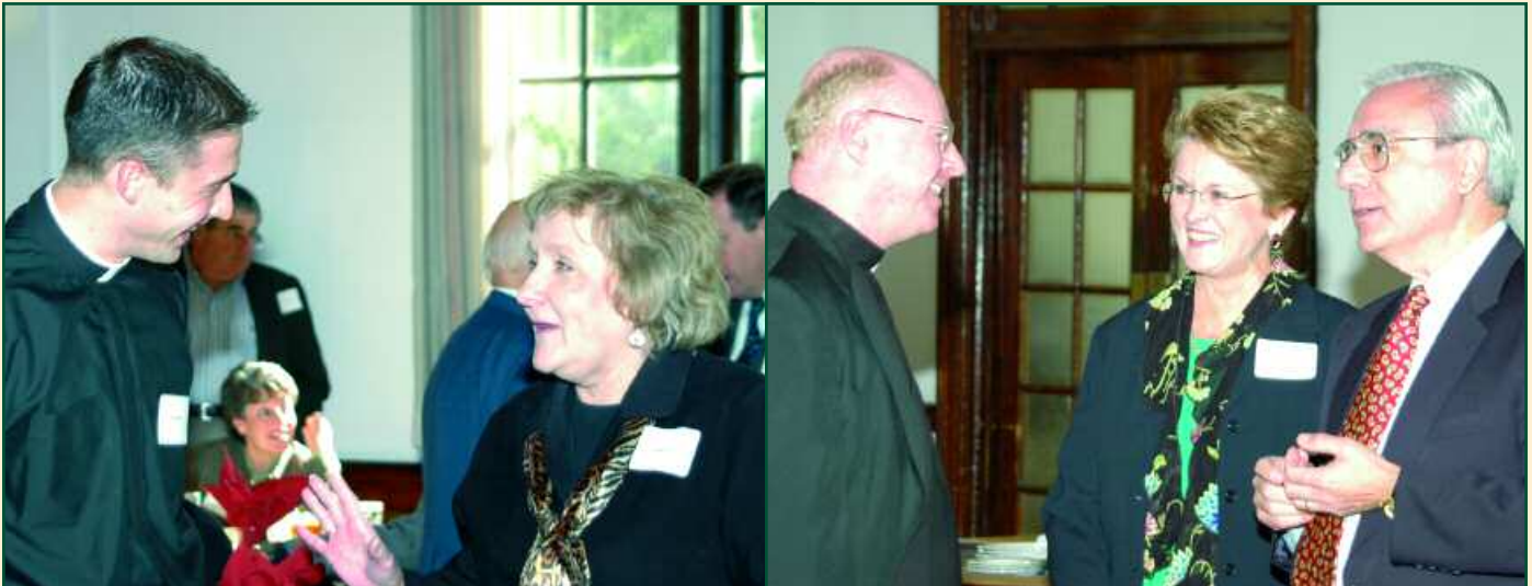
SCENES FROM THE ANNUAL DONOR APPRECIATION MASS AND BRUNCH ON SUNDAY, OCTOBER 17, 2004. THIS EVENT AFFORDS ST. CHARLES BORROMEIO SEMINARY THE OPPORTUNITY TO EXPRESS APPRECIATION FOR THE FAITHFUL AND GENEROUS SUPPORT OF ITS FRIENDS AND BENEFACTORS.