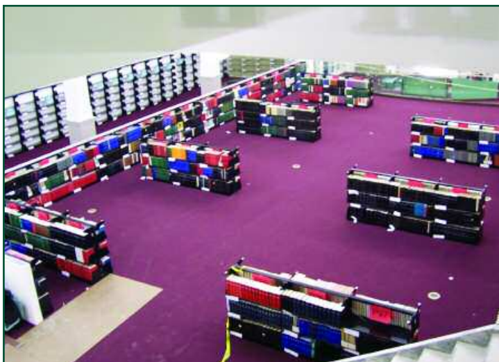
THE RENOVATED DESIGN OF THE LOWER LEVEL INCLUDES A RAISED PLATFORM, WHICH MAXIMIZES SPACE AND SERVICEABILITY. READING AREAS WILL BE DEPLOYED THROUGHOUT THE LOWER LEVEL.