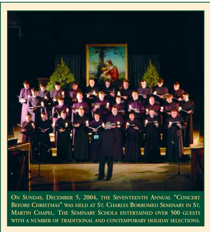
ON SUNDAY, DECEMBER 5, 2004, THE SEVENTEENTH ANNUAL “CONCERT BEFORE CHRISTMAS” WAS HELD AT ST. CHARLES BORROMEIO SEMINARY IN ST. MARTIN CHAPEL. THE SEMINARY SCHOLA ENTERTAINED OVER 500 GUESTS WITH A NUMBER OF TRADITIONAL AND CONTEMPORARY HOLIDAY SELECTIONS.