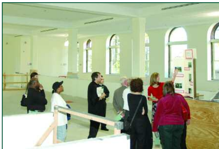
VISITORS AT THE ANNUAL OPEN HOUSE ON SUNDAY, OCTOBER 31, 2004, WERE GIVEN A TOUR OF THE NEARLY COMPLETED LOWER LEVEL OF THE RYAN MEMORIAL LIBRARY.