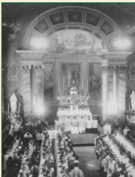
THE TRADITION OF THE MIDNIGHT MASS ON THE FEAST OF IMMACULATE CONCEPTION, DECEMBER 8TH, REMAINS A LONG-STANDING TRADITION.