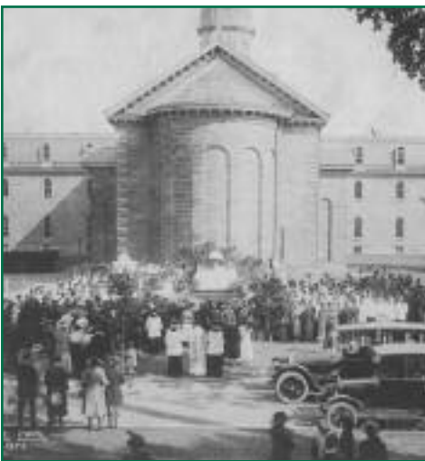
THE IMMACULATE CONCEPTION CHAPEL HAS SERVED AS THE HEART OF SEMINARY LIFE FOR OVER 131 YEARS.