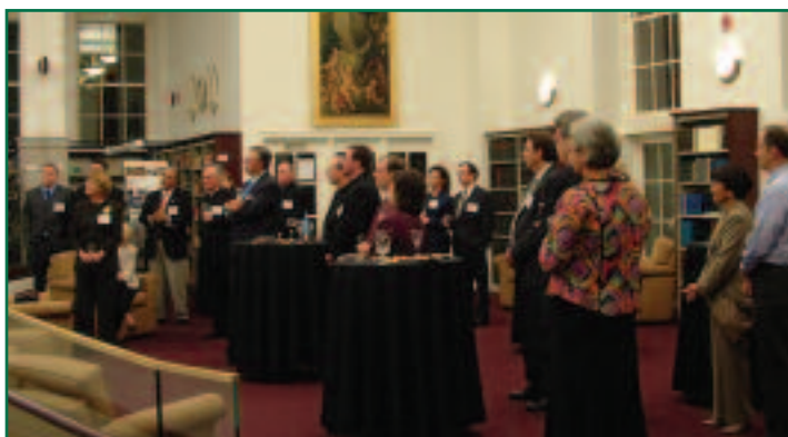
OCTOBER'S FIRST ANNUAL APPEAL KICKOFF HELD AT THE ANTHONY CARDINAL BEVILACQUA THEOLOGICAL RESEARCH CENTER AT THE RYAN MEMORIAL LIBRARY.

If you have not had the opportunity to make an offering to the Annual Seminary Appeal, or you did not receive an Appeal mailer, please know that contributions for the