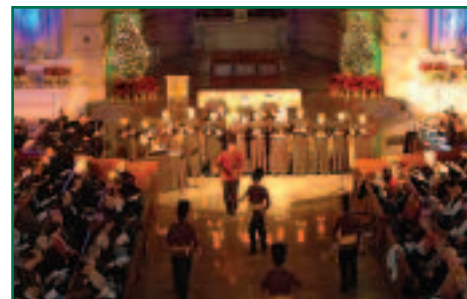
"TOY SOLDIERS" ENCOURAGED AUDIENCE PARTICIPATION IN THE SINGING OF THE TWELVE DAYS OF CHRISTMAS.