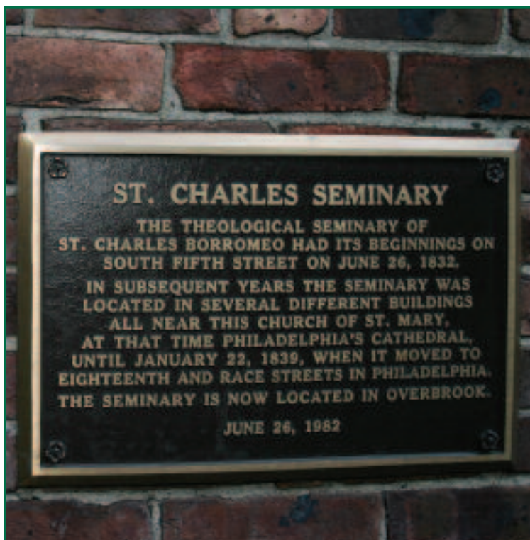
THIS PLAQUE LOCATED IN THE OLDE CITY SECTION IN DOWNTOWN PHILADELPHIA MARKS SAINT CHARLES SEMINARY'S FOUNDATION IN THE EARLY NINETEENTH CENTURY.

may truly proclaim Jesus as the Way, the Truth, and the Life. These men are a great gift to the Church, and the faithful support that you show for them is truly appreciated by all members of our community.