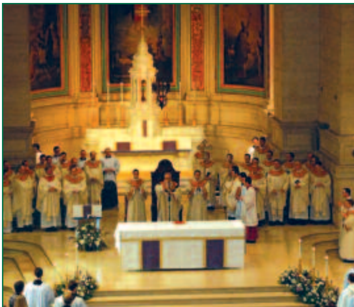
FORTY HOURS OF DEVOTION CAME TO A CLOSE WITH A BENEDICTION IN THE CHAPEL OF SAINT MARTIN OF TOURS ON NOVEMBER 3, 2006.

BY GERALD SOUZA, III COLLEGE, ARCHDIOCESE OF BOSTON