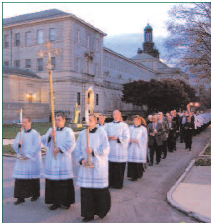
A WALK THROUGH TIME: EACH YEAR SEMINARIANS MAKE THEIR SOLEMN PROCESSION FROM THE IMMACULATE CONCEPTION CHAPEL TO THE SAINT MARTIN OF TOURS CHAPEL BEFORE THE CLOSE OF DEVOTION

The following day, the fourth of November, the Seminary celebrated its patronal feast of Saint Charles Borromeo. Seventeen men from the class of II Theology, representing 11 dioceses and religious orders, were instituted into the Ministry of Reader by Cardinal Justin Rigali within Mass on this day. The "Upper Side — Lower Side" Football Game, a venerable St.