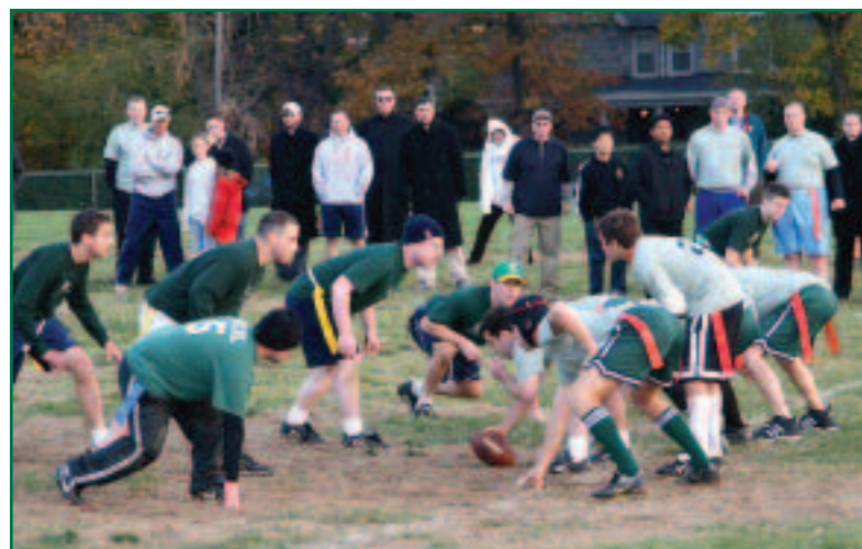
THE UPPER SIDE'S 10-GAME WINNING STREAK WAS ON THE LINE DURING THIS ANNUAL GRIDIRON TRADITION.

evening, with a Solemn Procession from Immaculate Conception Chapel in the Theology Division to the Chapel of Saint Martin of Tours in the College Division. After Solemn Evening Prayer and Benediction, the Blessed Sacrament was reposed and the devotion was officially