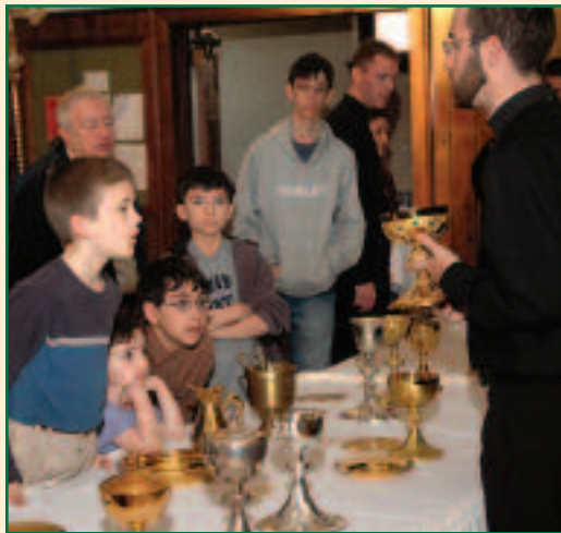
VISITORS, BOTH YOUNG AND OLD, WERE AMAZED AT THE MANY HISTORIC AND SPIRITUAL ARTIFACTS ON DISPLAY.

Each year the seminary is honored to welcome a diverse group of visitors. Some of our guests are passers-by who see the sign out along City Line Avenue and come in to see what lies behind the great black fence and gates. But you will