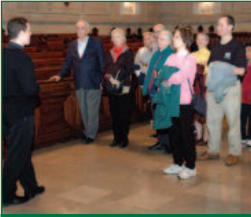
THE CHAPEL OF SAINT MARTIN OF TOURS ALWAYS DRAWS GREAT ATTENTION DURING THE ANNUAL OPEN HOUSE.

On Sunday, October 29, 2006 Saint Charles Borromeo Seminary once again opened wide its doors to the public for the 53rd Annual Open House. Over 560 guests arrived to the campus to view the stimulating works of art, symbols of the Archdiocese's rich history, and the beauty of our grounds. Two of the more popular