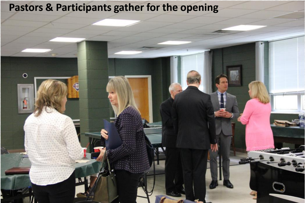
Pastors & Participants gather for the opening