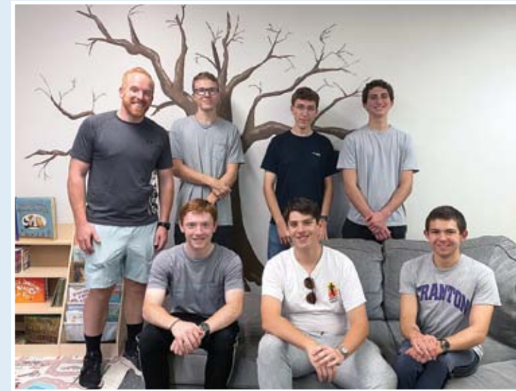
Annie's Home, Philadelphia