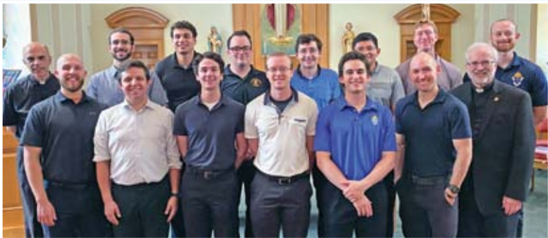
Joseph and Mary Retreat House, Mundelein, IL