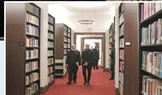
St. Jerome Library, Student Life Center

On Friday, October 11, Alumni Priests celebrated Vespers in the Immaculate Conception Chapel, followed by a reception and seminarian-led tours of the campus.