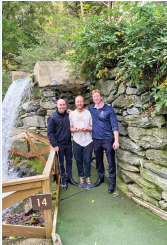
Fall Miniature Golf Outing