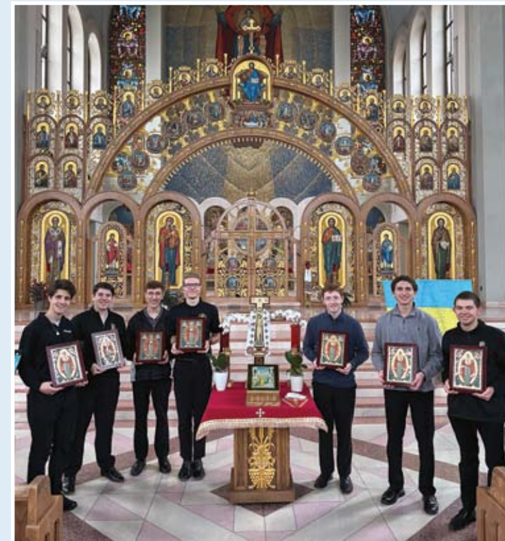
Ukrainian Catholic Cathedral of the Immaculate Conception, Philadelphia