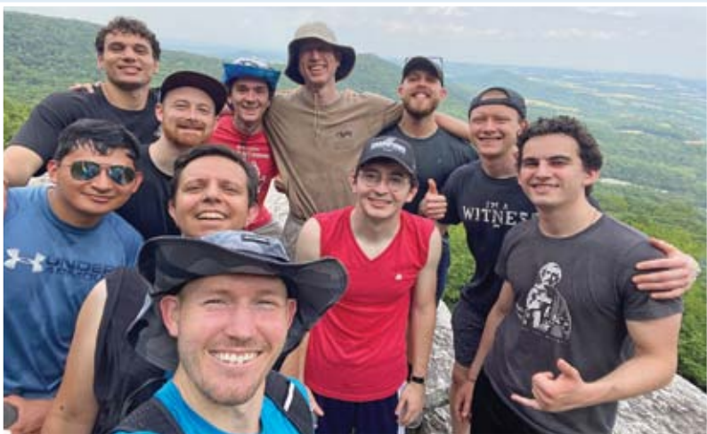
Pulpit Rock in Appalachian National Scenic Trail, Kempton, PA